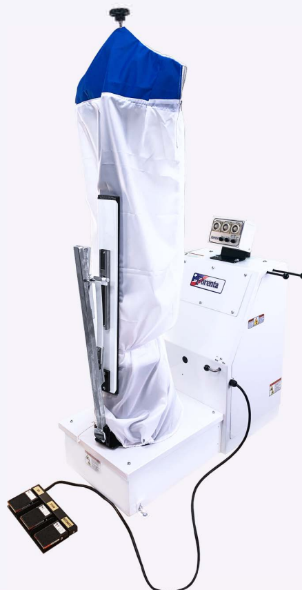
604AFL Form Finisher