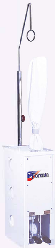
81SF Sleeve Finisher